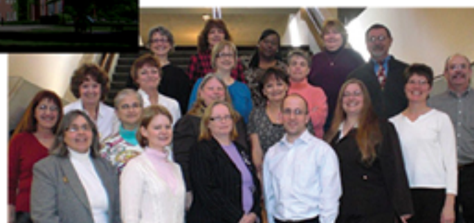
The Library Team

The IR is embedded into the library's workflows and culture, too. Contributing to Digital Commons is written into job descriptions, and recognized in tenure and promotion guidelines. ■